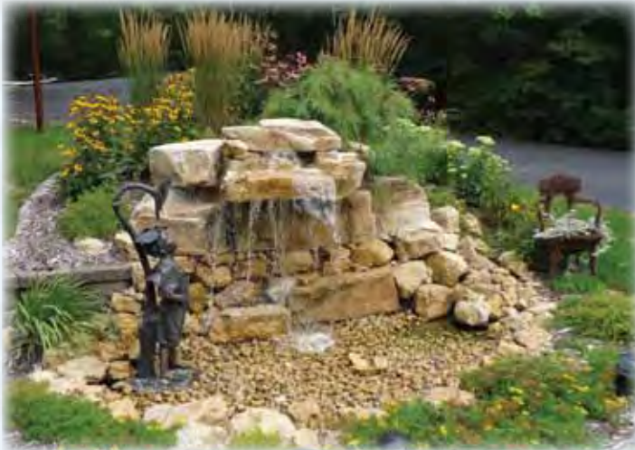
Just-A-Falls built by Aquatic Rock in Minnesota

Build a waterfall without a pond — ideal for businesses and home owners who want the sights and sounds of a waterfall but do not want the liability or maintenance associated with a pond!