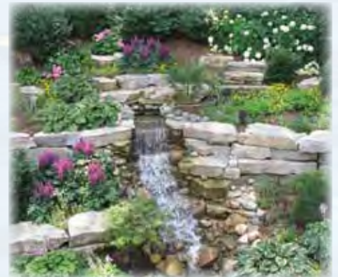
Just-A-Falls built by Natural Creations in Michigan